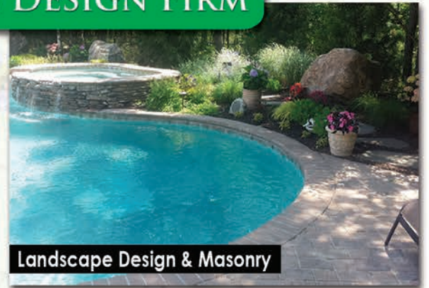
Landscape Design & Masonry