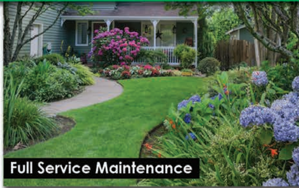
Full Service Maintenance